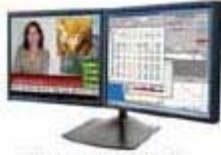
Two panel wide