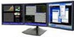
Three panel wide